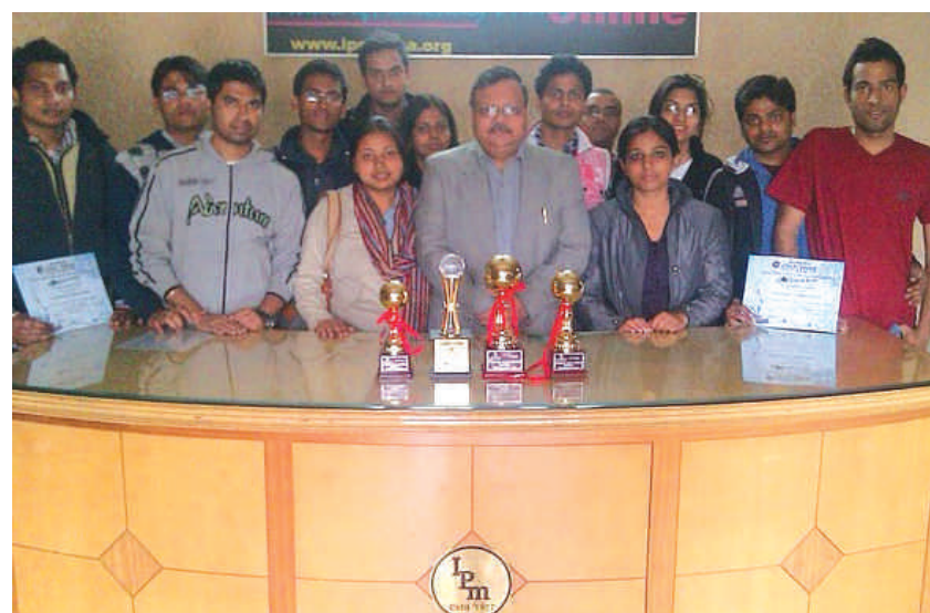
Students with Trophies won at Gyan Vihar

“If you think you can win, you can. Faith is necessary to lead you to victory”. With this faith students of