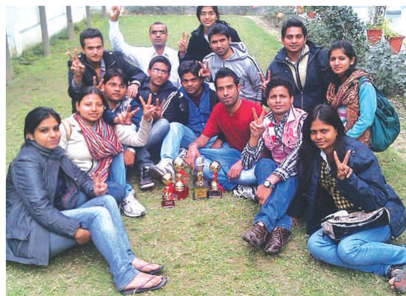
Winning Attitude- Students at Gyan Vihar

championship. As in the book of IPM, Meerut every page is full of glory and victory and this time again students added one more page of glorifying victory.